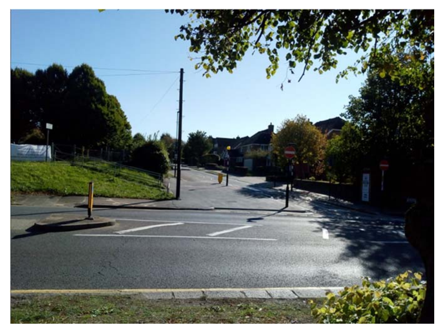
Image 2 - Current one way junction at Melville Avenue/ Coombe Lodge, and entrance to school

3.5 The site is bound to the north by Coombe Road, to the west by Melville Avenue, to the south by Coombe Wood and residential dwellings and to the east by 100/102 Coombe Road and the Grade II listed Coombe Lodge. The surrounding area comprises a mix of residential, woodland and green open space.